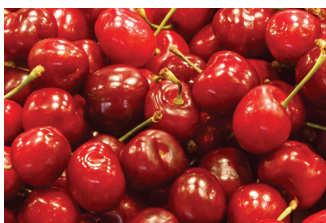
Tart Cherry Extract